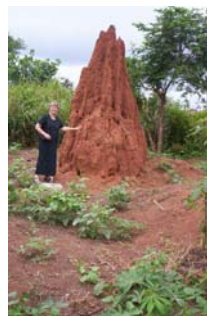
Large termite hill